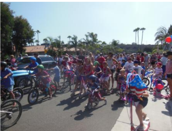
Parade in 2014