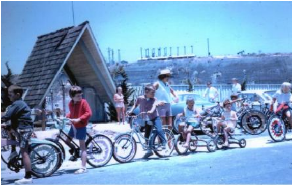
Parade in 1963